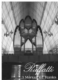
Fratelli Ruffatti Pipe Organs Padua, Italy

New 4 Manual Console to be interfaced with 45 Rank Casavant Pipe Organ at Sligo Seventh Day Adventist Church Takoma Park, Maryland